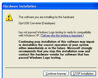
Fig 2: Windows Logo Testing Message