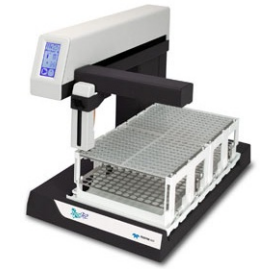
Fig. 1: Teledyne Foxy R1 - R2 fraction collector

This manual describes the setting of the Teledyne Foxy R1 - R2 fraction collector. The control module enables direct control of the instrument over serial line or LAN