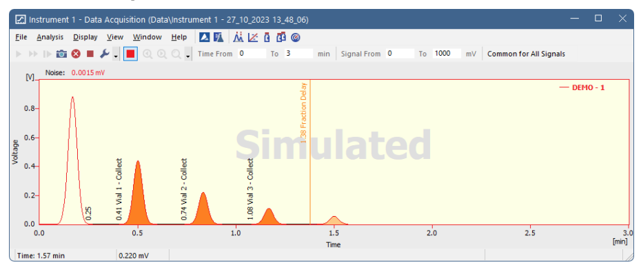
Fig. 10: Data Acquisition window

The Data Acquisition window can display the fractions in the graph using the background color and also the start and stop fraction events and marker of the Fraction Delay. To see the fractions and markers right click on the graph, select Properties ... to open the Graph Properties dialog and check the Show Events checkbox.