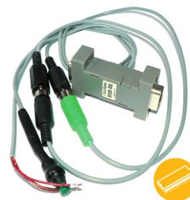
Digital Input Device